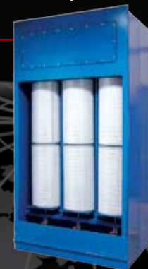
PC-100 Collector Module