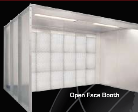
Open Face Booth

GFS Engineered means the best quality finish every time. When you purchase from GFS, you receive top quality finishing equipment proven to increase productivity, improve finish quality, and provide the highest levels of energy efficiency.