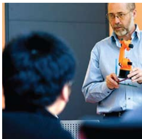
Robot training at Kuka College.